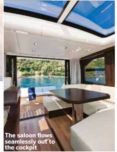
The saloon flows seamlessly out to the cockpit