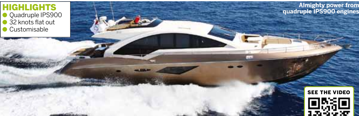
Almighty power from quadruple IPS900 engines