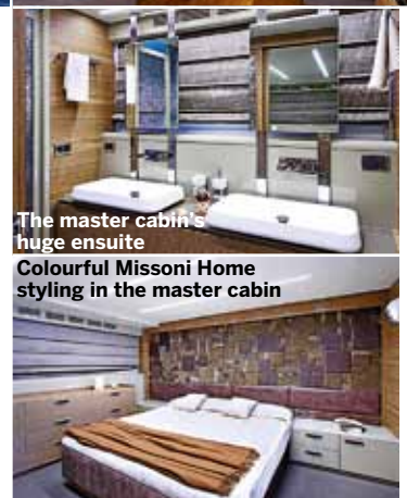
The master cabin's huge ensuite Colourful Missoni Home styling in the master cabin

Length 85ft 3in (15.81m) Beam 20ft 6in (6.27m) Engines Quadruple Volvo Penta IPS900 Top speed 32 knots Price from €5.2 million ex tax