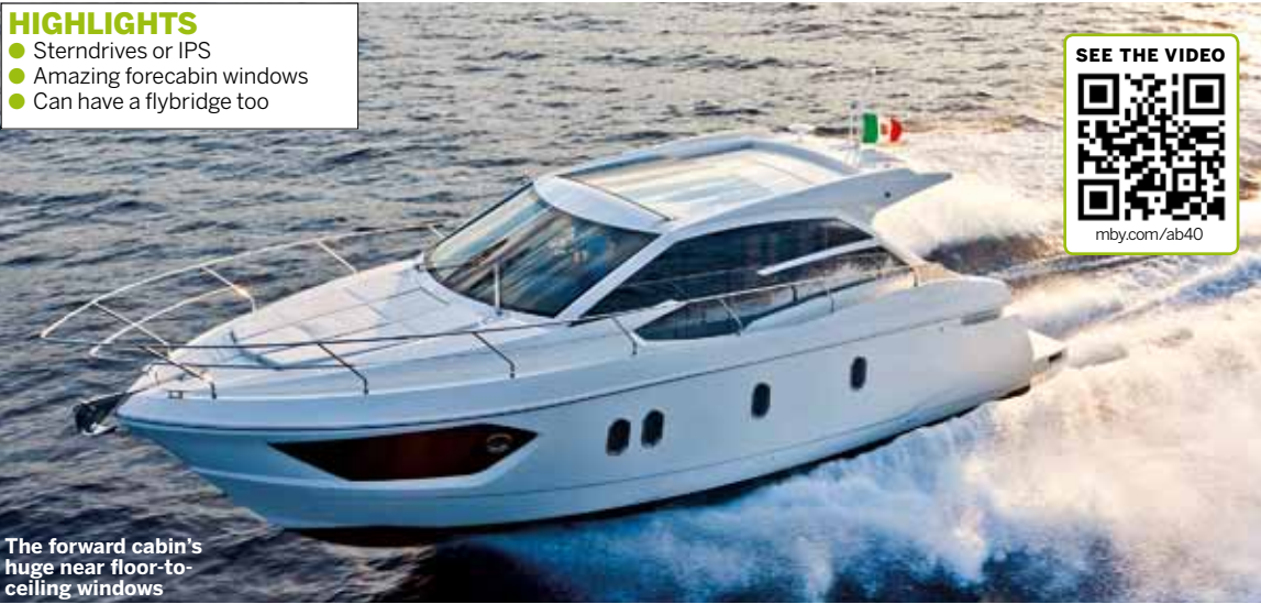
The forward cabin's huge near floor-to-ceiling windows