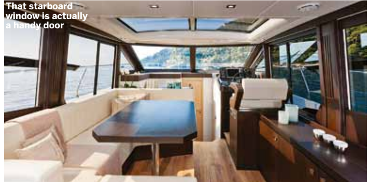
That starboard window is actually a handy door

Length 39ft 4in (12.00m) Beam 13ft 5in (4.10m) Engines Twin Volvo Penta D4 300hp Top speed 37 knots (MBY est) Price from £352,069 inc UK VAT