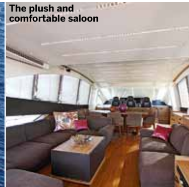
The plush and comfortable saloon